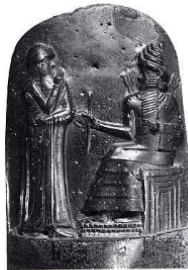
Top Quarter / Fingernail