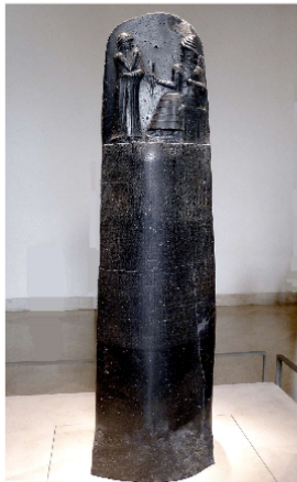
6 foot tall stele

→ Directions: Examine the image below, then fill out the chart with what you see, think and wonder about society in the Babylonian empire.