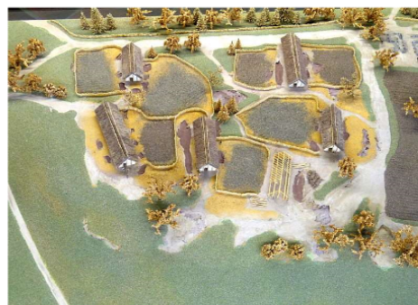
AMK - Linearbandkeramik Modell Hienheim 2.jpg by Wolfgang Sauber is published under the CC BY-SA 4.0 license

If you were to leave a community that lived a Paleolithic lifestyle to join a Neolithic one, what do you think would be the hardest thing to get used to?