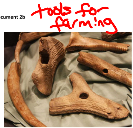
CucufeniAgriculture.JPG by CristianChirita is published under the CC BY-SA 3.0 Unported license These tools were used by Neolithic farmers to plough fields, plant crops, and harvest the plants. The tools are made out of deer antler.

2a Based on the images and description above, describe the technology used during the Neolithic Era. [1]