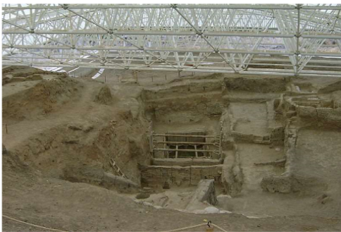
Catal Huyuk 10.JPG by Stipich Béla is published under the CC BY-SA 3.0 Unported license