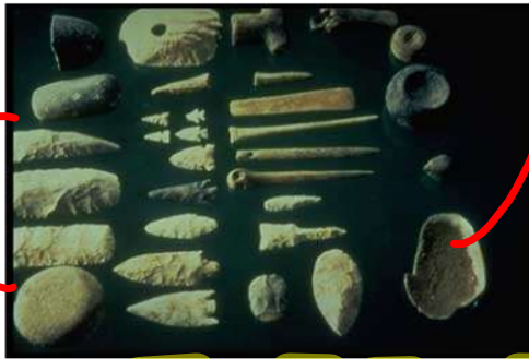
Tools from Hunter-Gatherer Societies

scraper - green jasper - South Central Sahara Desert 5,200 BCE - 2,500 BCE