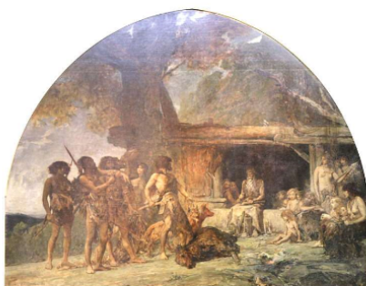
Image modified by New Visions (CC BY-SA NC). Original image is from Wikimedia and is in the public domain

A modern day artist created these images to show the paleolithic lifestyle.