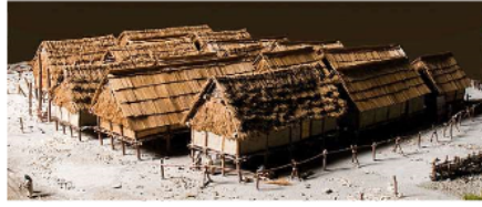
Laténium-maguette-village-laustre.jpg by Laténium is published under the Creative Commons Attribution-Share Alike 3.0 Unported license

permanent settlements- places where people live for long periods of time, possibly for their whole lives